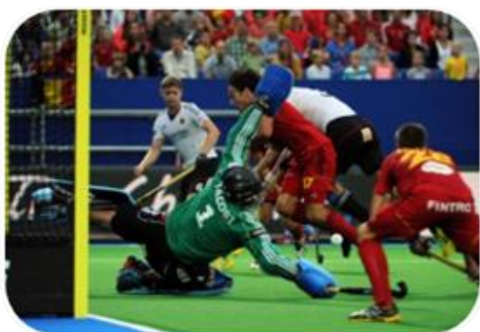
Breda Push workshop U18/U16 in August