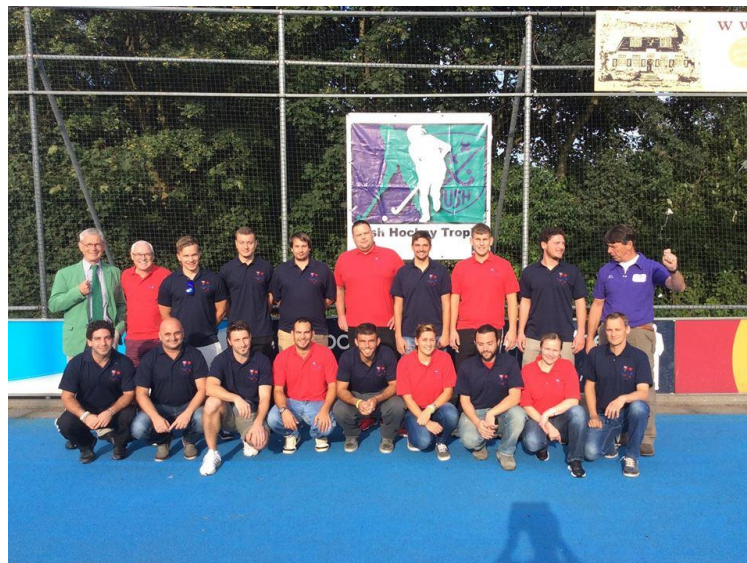
C4E Group in Breda 2014

The C4E targets talented young coaches from Europe and provides a programme of events running over a two year period. The programme is planned by the EHF Coaching group who organise workshops and webinars for the C4E group