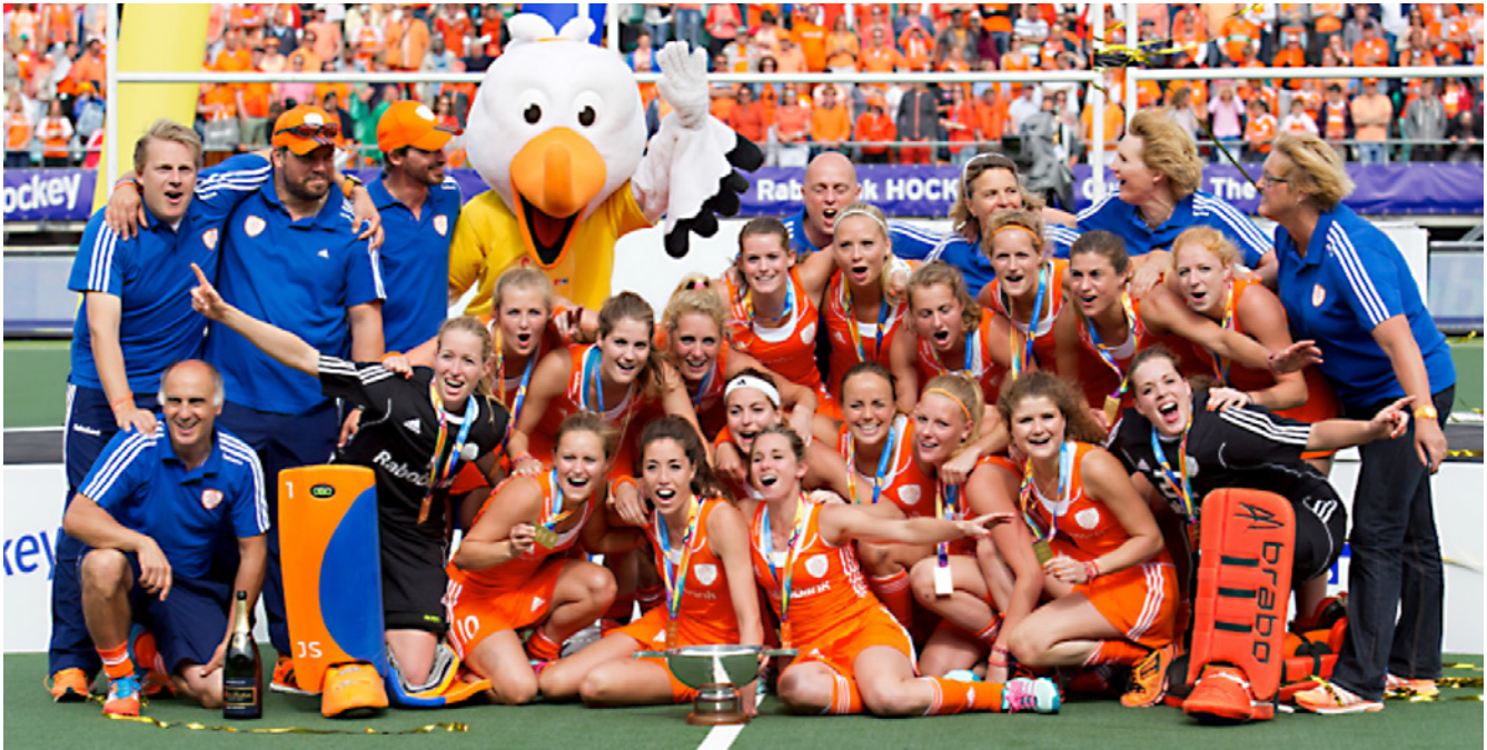
The Netherlands are the most successful team in the history of the Hockey Women's World Cup.